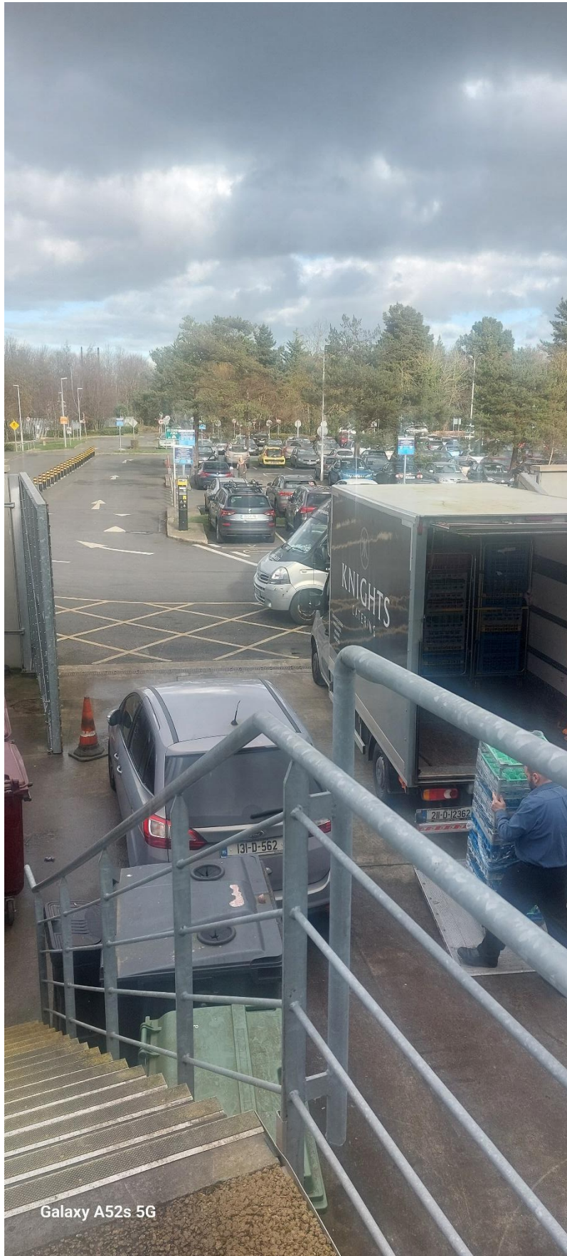
Galaxy A52s 5G