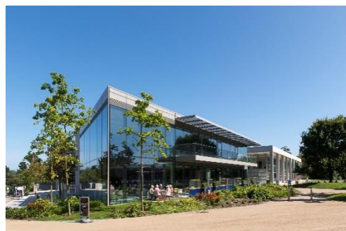
UCD University Club (Connected to O'Reilly Hall)

An interactive map of UCD can be found here . Venue, directions and travel information can be found on the venue, travel and social webpage .