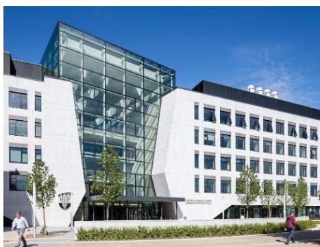
O'Brien Centre for Science