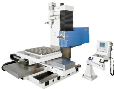
Figure 1: A boring machine from Alesamonti

The first computation phase consists of choosing, within the database, the information that must be considered more relevant because collected in operating conditions more similar to current ones. Because the problem is not linear, but in general requires a robust solution that can avoid overfitting problems, it was implemented using a support vector machine kernel (SVM). In a nutshell, this means collecting in vectors the main characteristics of the load, the temperature field and other relevant parameters. These vectors, of size d_v , are projected in a vector space of dimension d > d_v . This remapping in a larger space allows to separate the vectors through a linear hyperplane properly calculated. The identification of separation hyperplanes is done considering, for each vector, that is for each set of conditions, the corresponding compensation value in the table.